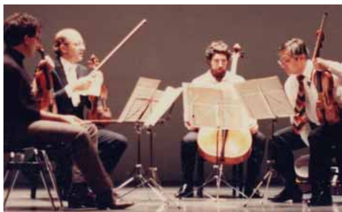
Sydney String Quartet circa 1984